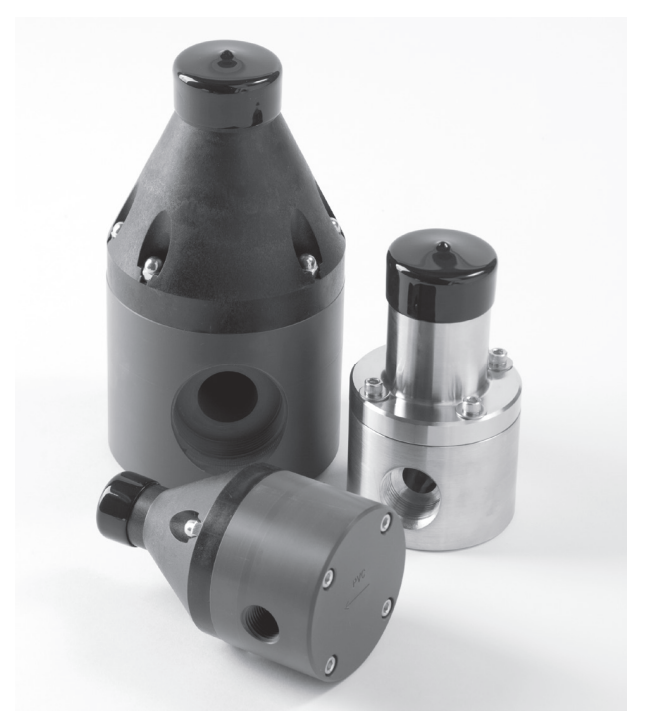
Griffco G-Series diaphragm back pressure valves are designed to enhance the performance of chemical feed systems by applying a continuous back pressure to the chemical feed pump, while also acting as an anti-syphon valve. Robust construction ensures reliability in the rigorous service of municipal and industrial applications. Wetted materials include: PVC , CPVC , PP , PVDF , PTFE , Halar , 316 SS , A20 and Hast . C . Available sizes: 1/2" – 4".

sales@griffcovalve.com www.griffcovalve.com